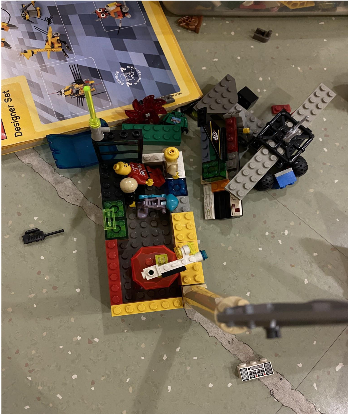
Child Case Study