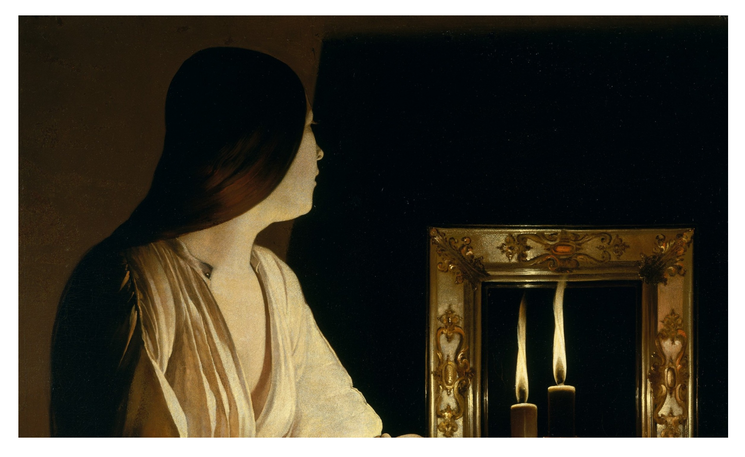
https://commons.wikimedia.org/wiki/ File:Georges_de_La_Tour_010.jpg PD US

Notice how the only light seems to be associated with appearances of the girl with whom the boy is infatuated. In all his descriptions of her, she is edged in an almost holy light.