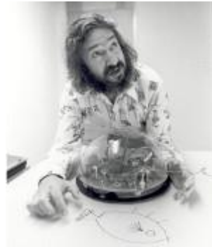
Figure 1. Seymour Papert and LOGO-based robot Turtle.

adoption of this philosophy is not surprising, considering his experience working alongside Piaget in the Centre of Genetic Epistemology in Geneva between 1958 and 1963. LOGO was thus designed as an environment conducive to and supportive of Piagetian learning (Logo, 2015).