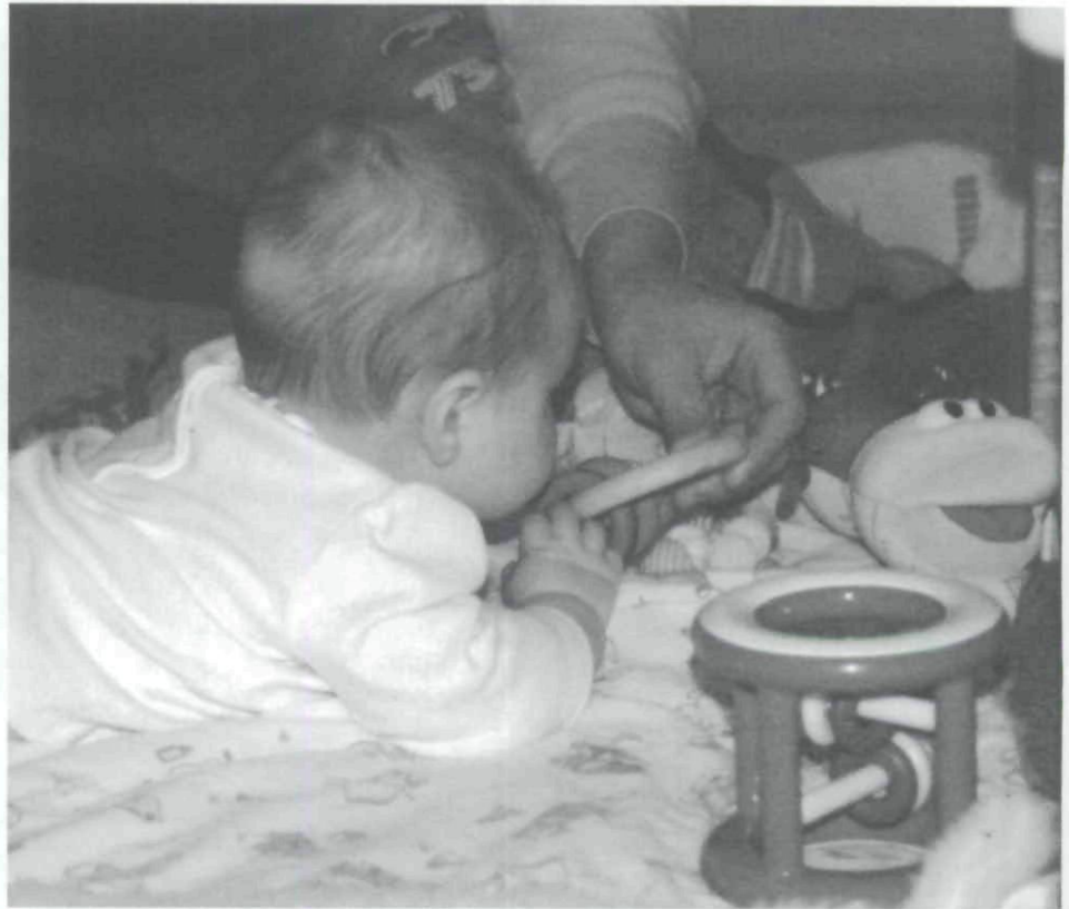
Subjects & Predicates

In this sense, children's social and emotional development and competence are recognized and valued as