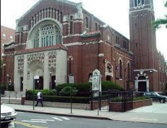
St. Bartholomew Church.