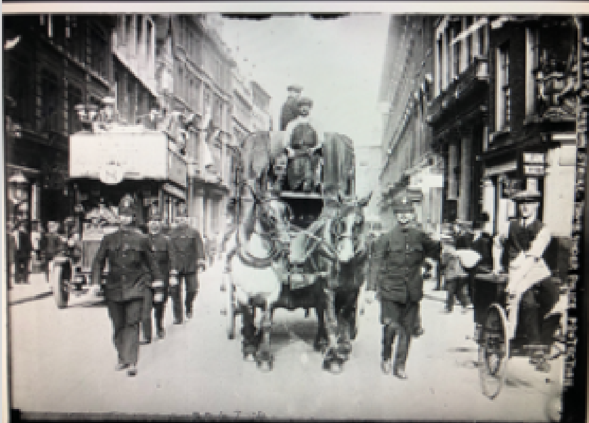
London Strike: Truck Under Protection

The United States saw tremendous growth in major cities, had the industrial revolution, and the abolished slavery, which is when the Political Era of policing was set into motion. As its name suggests, it was an era of politics, mainly because of how policing was limited as a result of new laws, made clear by the Constitution. America answered the call by following the English and Sir Robert Peel's principles. Not unlike today, policing during this era was under the control of politicians. Politicians, like the mayor, had no problem controlling everything a policeman did during his call of duty ( NOTE: the word policeman/men is utilized in this era/context, because during this time period, women were not allowed in the profession, and if they were accepted it was under a microscopic view of certain stereotypical matronly duties to be performed). In fact, Black policemen were rarely hired. Black policemen made their way into policing in the late 1800s, but when the Civil Rights Act of 1875 was ruled unconstitutional, Black officers all but disappeared from policing until the 1950s.