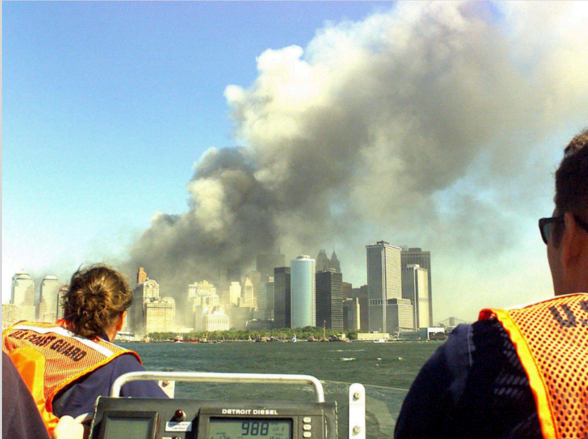
Remembering 9/11: A Decade Later

Era shifted to the Homeland Security Era as airplanes destroyed America's feelings of safety. Policing will probably always involve some sort of Community Era policing in order to make a difference.