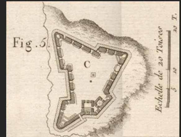
Fortress of San Felipe Cartagena, Colombia 1630