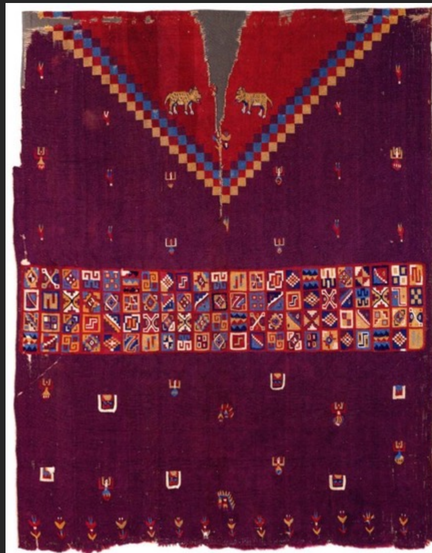
Male Tunic ( Uncu ) Peru, Colonial Period, 16 th -17 th century