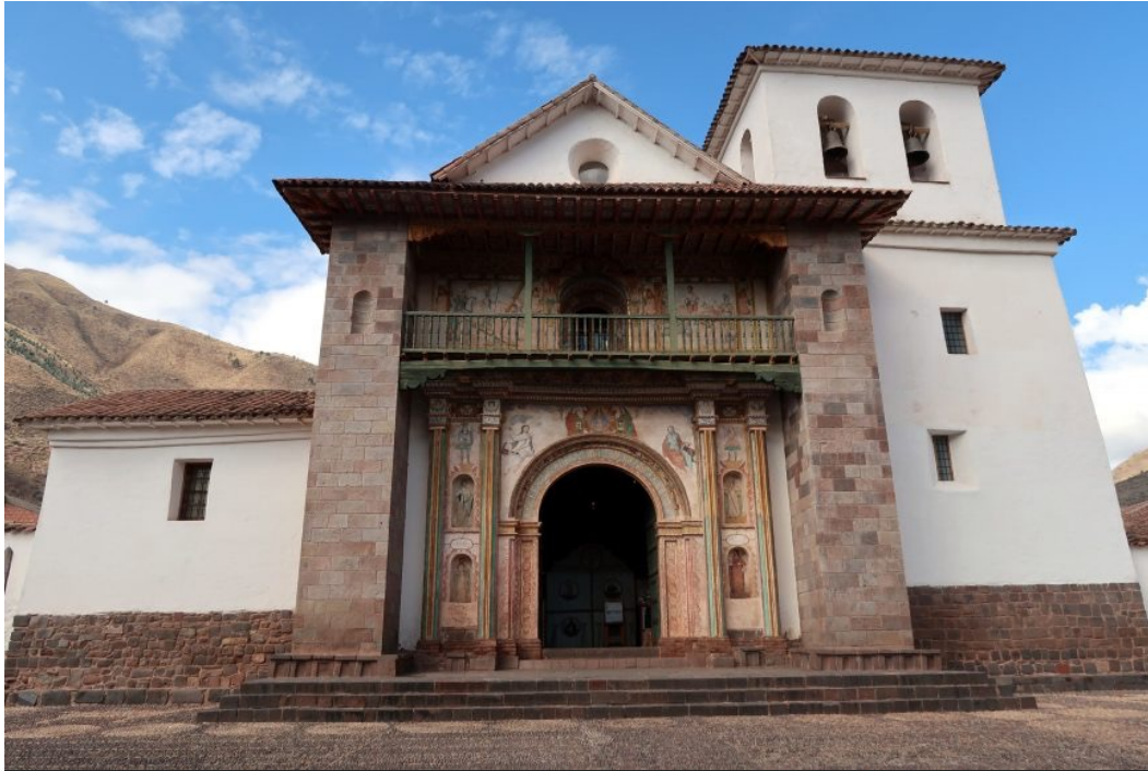
Church of Andahuaylillas Cuzco, Peru

https://smarthistory.org/the-church-of-san-pedro-apostol-de-andahuaylillas/