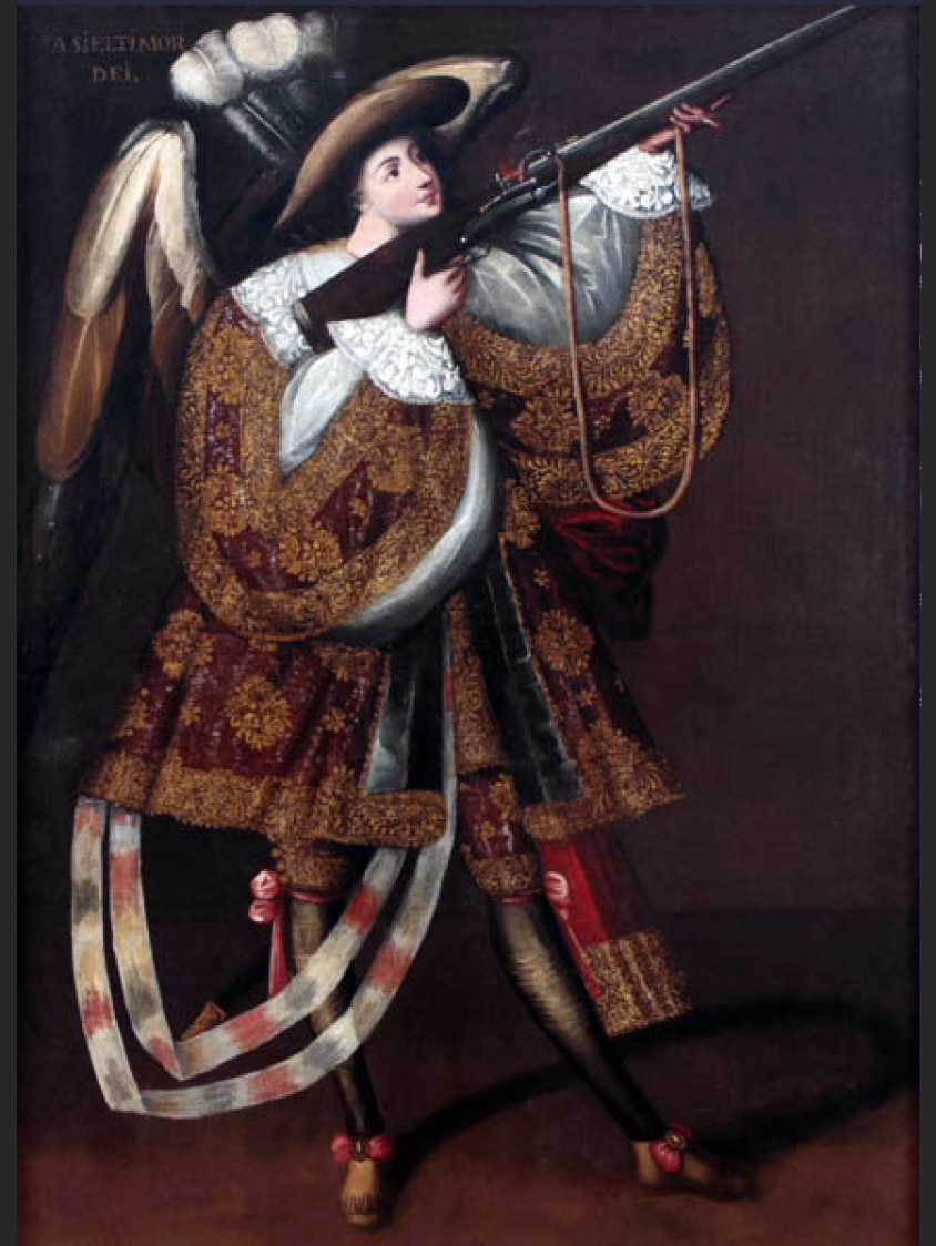
Master of Calamarca, Archangel with Gun, Asiel Timor Dei, before 1728, oil on canvas and gilding