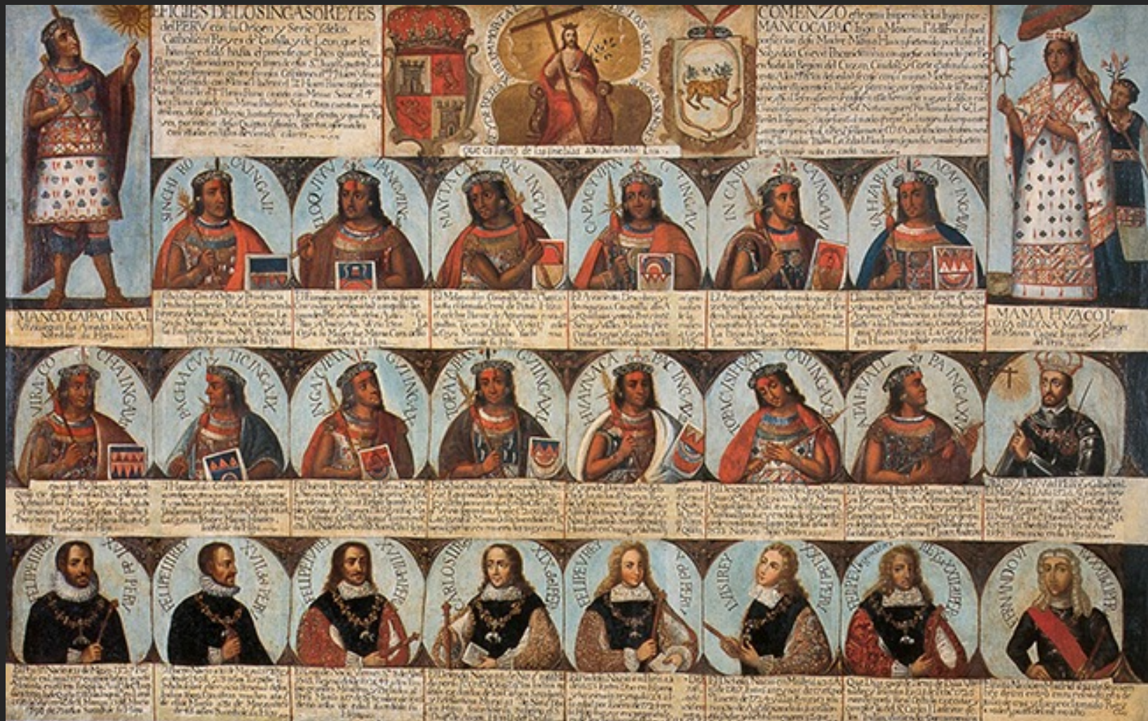
Effigies of the Inkas or Kings of Peru, c. 1725, Lima, Peru