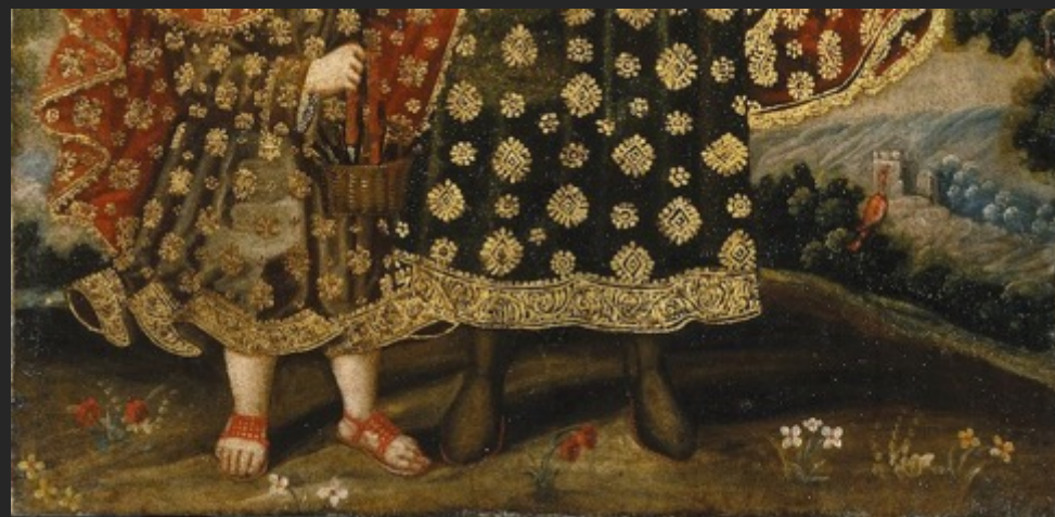
Saint Joseph and the Christ Child , late 17th-18th century, Peru