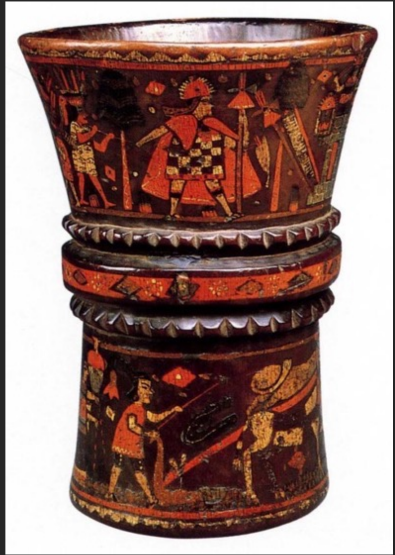
Colonial-Period Kero 17th-18th century Wood and pigment inlay