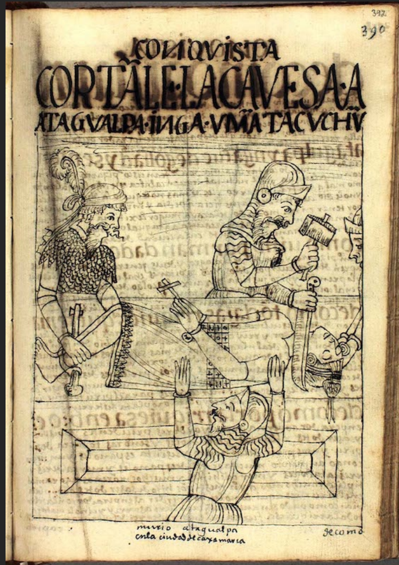
Felipe Guaman Poma de Ayala, The First New Chronicle and Good Government (or El primer nueva corónica y buen gobierno , c. 1615)