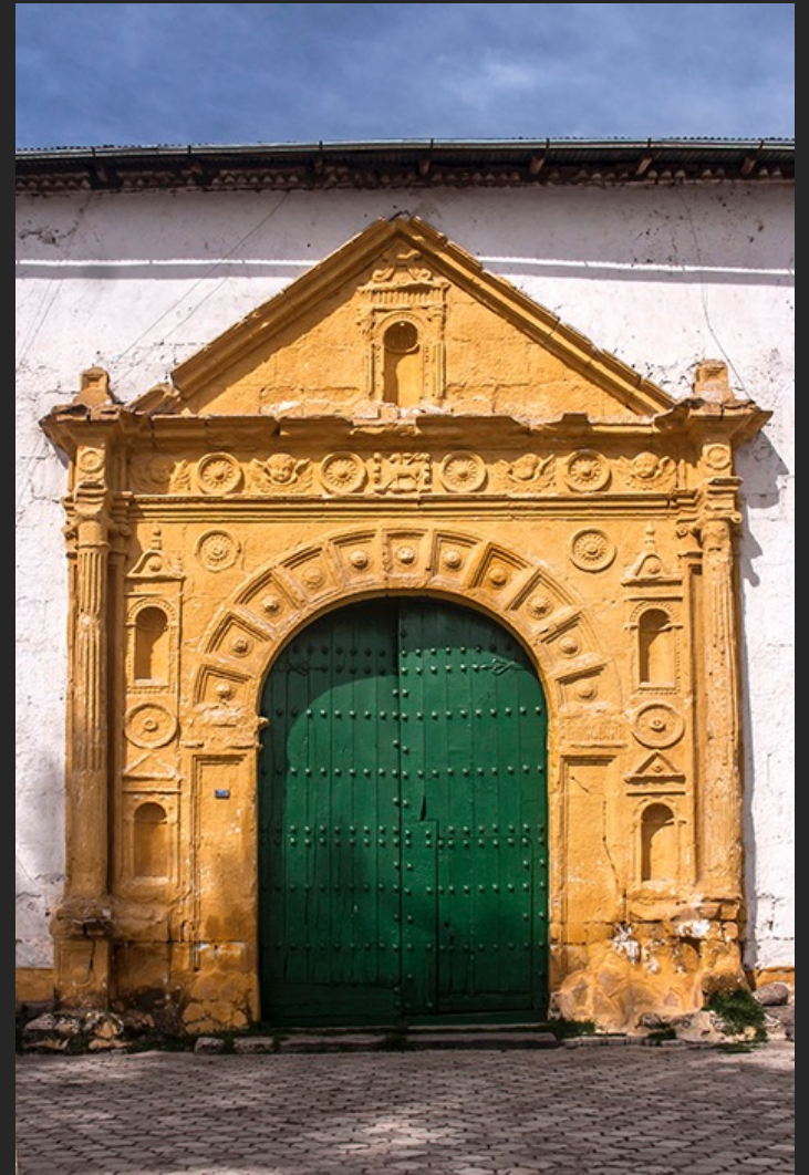
La Asunción, 1581-1608, Chucuito, Peru