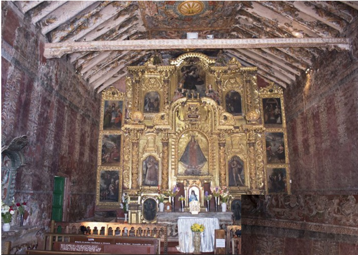
Mural painting imitating the appearance of textiles, 17th century, Chapel of Canincunca , Peru