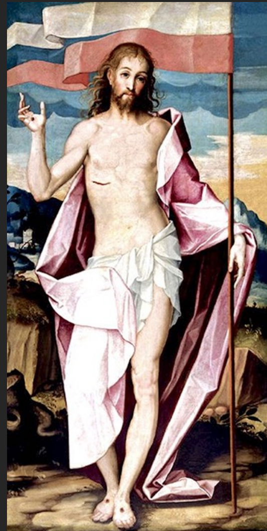
Bernardo Bitti, The Resurrection of Christ , 1603