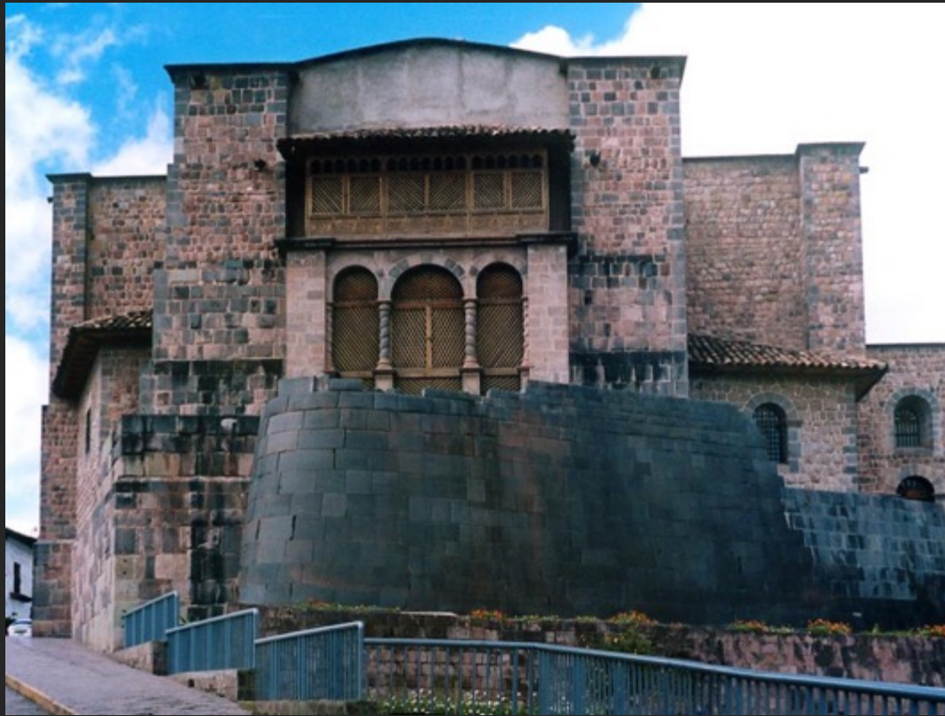
Mudejar: Spanish-Arab influence seen in wooden balconies