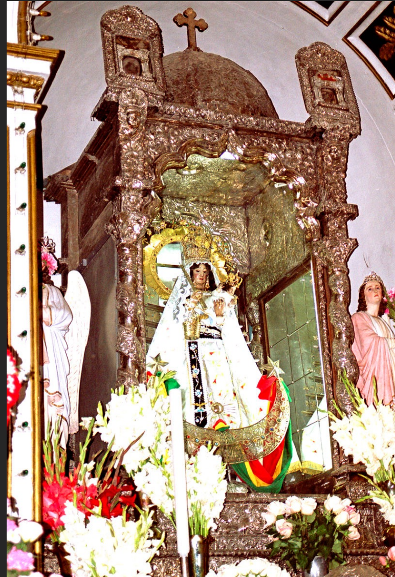
Our Lady of Cocharcas , 1765, Peru